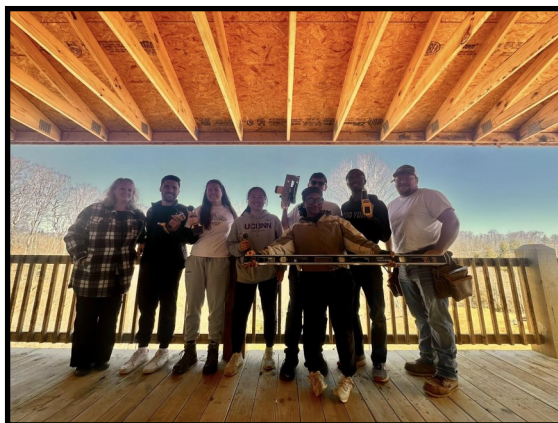
University of Connecticut volunteers

Banner Elk Presbyterian (NC) Bethel University (MN) Camp Linn Haven (NC) Camp Lutherock (NC) Covenant Presbyterian Church (NC) Culpeper Presbyterian Church (VA) First Presbyterian Church Newton (NC) Formosan UMC-East Bay (CA) Hilbert College (NY) Linville Ridge (NC) Martin Luther Chapel (MI) Port City Community Church (NC) Praying Pelican Ministries Summit Christian College (NE) Tuesday Quality Team University of Connecticut (CT) Wednesday FAB Team