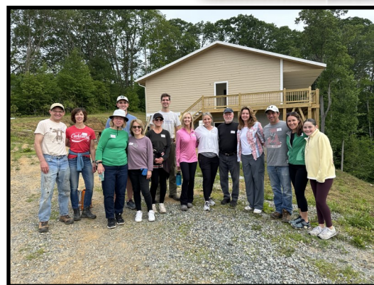
Linville Ridge volunteers