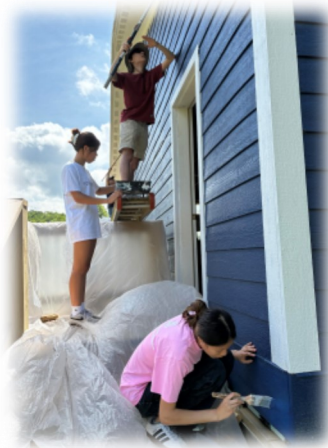
Formosan UMC volunteers