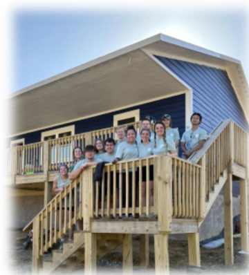
Bethel University volunteers