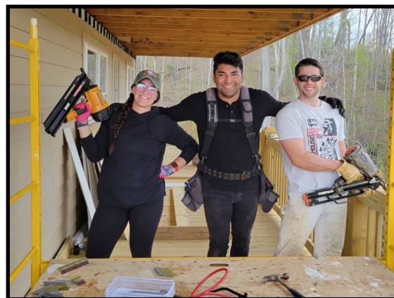
Port City Community Church volunteers

Thank You to all our volunteers who keep Avery Habitat building forward!!!